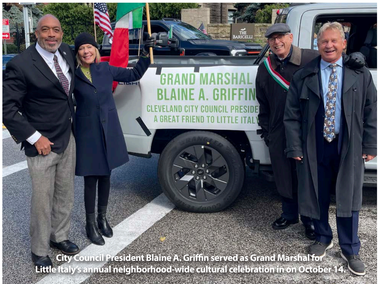
City Council President Blaine A. Griffin served as Grand Marshal for Little Italy's annual neighborhood-wide cultural celebration in on October 14.