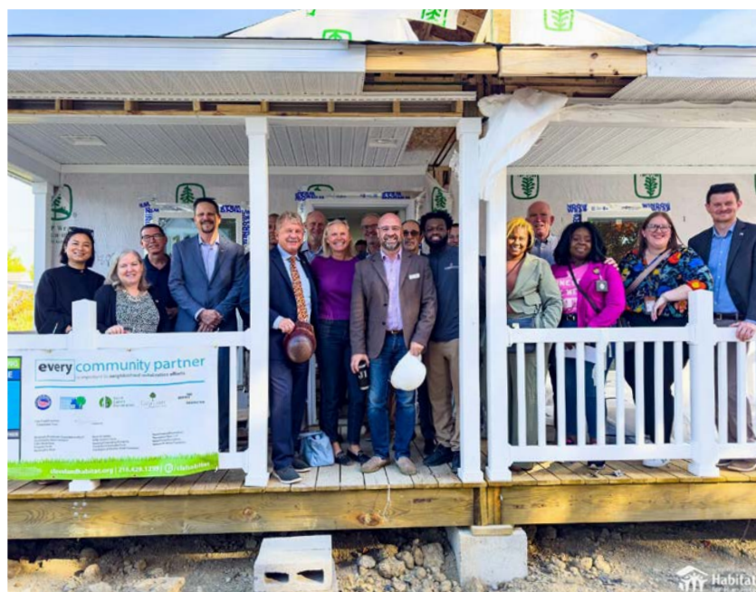
Images from the October 23, 2024 Greater Cleveland Habitat Modular Homes Installation Event on Matherson Ave.