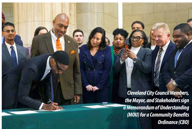
Cleveland City Council Members, the Mayor, and Stakeholders sign a Memorandum of Understanding (MOU) for a Community Benefits Ordinance (CBO)