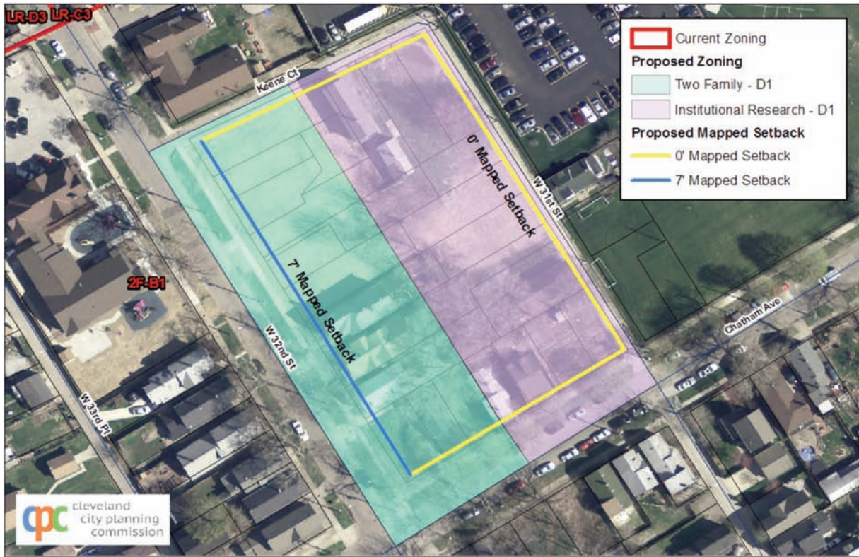
MAP CHANGE 2579 Changing the Uses and Area Districts of parcels of land northwest of Chatham Avenue between West 32nd Street and West 31st Street and adding zero foot and seven foot mapped setbacks.

Section 6. That this ordinance shall take effect and be in force from and after the earliest period allowed by law.