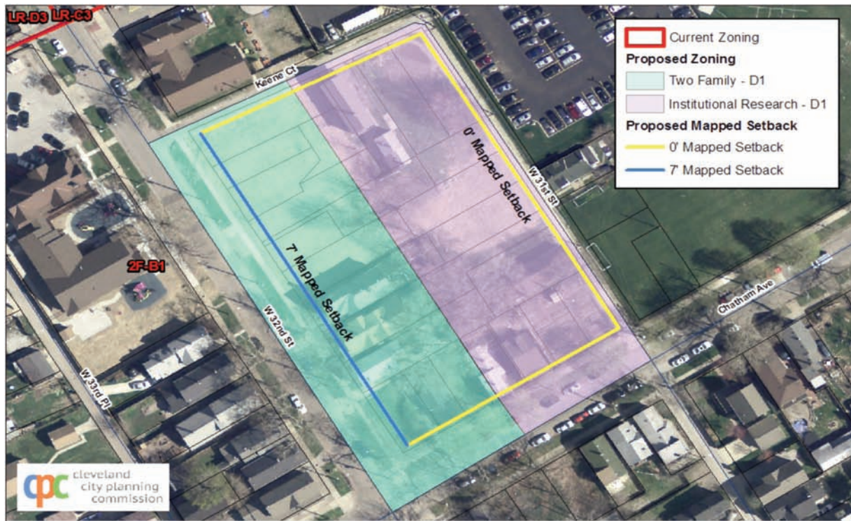
MAP CHANGE 2579 Changing the Uses and Area Districts of parcels of land northwest of Chatham Avenue between West 32nd Street and West 31st Street and adding zero foot and seven foot mapped setbacks.

Section 6. That this ordinance shall take effect and be in force from and after the earliest period allowed by law.