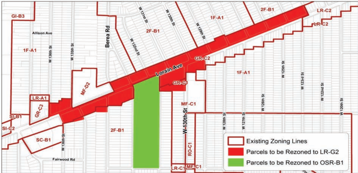
Area shaded in red to be rezoned from 2F-B1, MF-C1, GR-C1, and GR-C2 to LR-G2 Area shaded in green to be rezoned from 2F-B1 to OSR-B1 Map Change No. 2568

Section 4. That this ordinance shall take effect and be in force from and after the earliest period allowed by law.